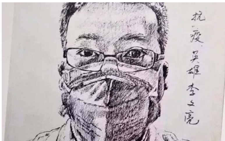
Chinese whistleblower Li Wenliang who issued a crucial early warning that was suppressed by government authorities as misinformation

From early on, national governments and the WHO themselves put out inaccurate information. Chinese authorities also stifled free speech, censoring frontline hospital physicians in Wuhan and accusing them of spreading misinformation when they reported on severe SARS-like symptoms in their patients in December 2019. Whistleblowers like Dr. Li Wenliang and his colleagues were arrested, reprimanded and silenced. Information on the nature of the outbreak was suppressed.